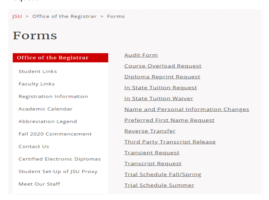
Step 2: That link will take you to MyJSU. Please sign in and click the button that reads "Complete this Form."

Step 1: From the Registrar's Office webpage, select <u>Student forms</u>, and click on Preferred First Name Request.